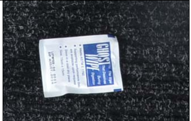
Sample 2 : Bland and Spike PASSED