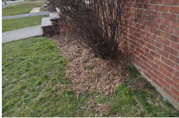
No exposed soil on side yards. All areas are grass or mulch covered.