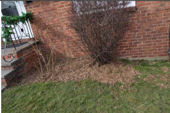
No exposed soil near front areas. All areas are grass or mulch covered.