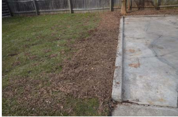
No exposed soil near garage areas. All areas are grass or mulch covered.

Please go to www.houseinvestigations.com and download the lead safe brochures, pamphlets, information, and all other relevant lead data. The files are in PDF format