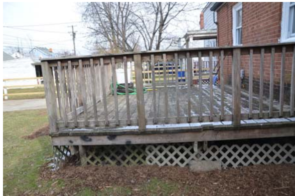
No peeling paint on porch and deck timbers