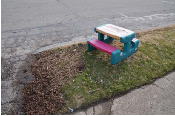
No exposed soil in front yard. All areas are grass or mulch covered.