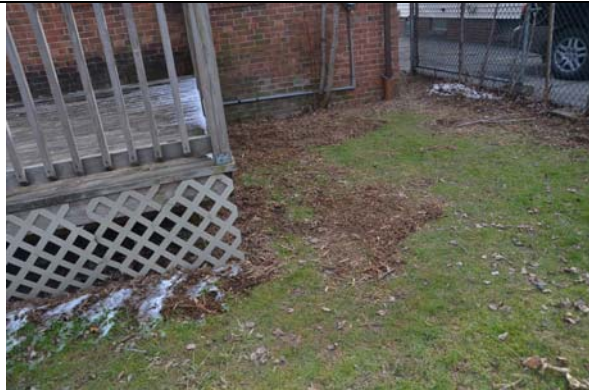
No exposed soil near deck areas. All areas are grass or mulch covered.