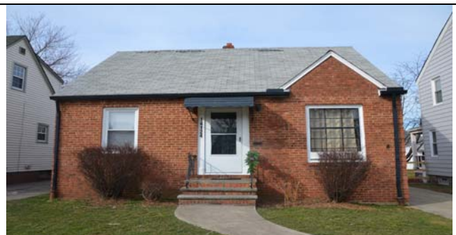
No peeling paint on any exterior surface of entire home.