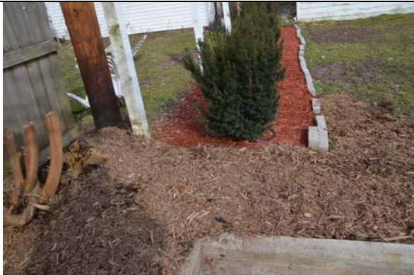
No exposed soil on back yards. All areas are grass or mulch covered.