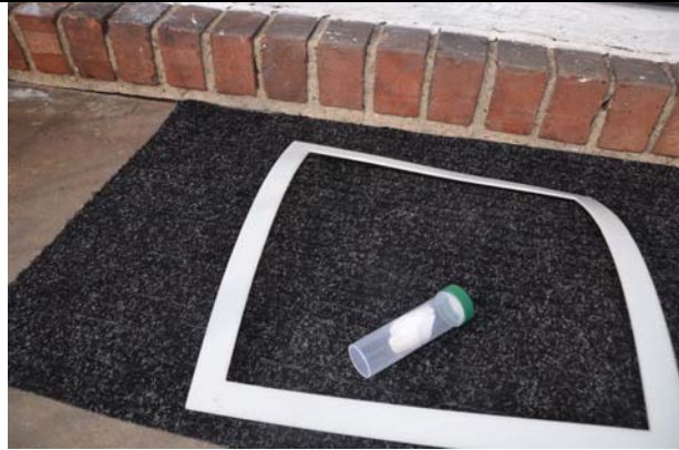
Sample 1: Front Door South 12 X 12 = 144 SQIN PASSED