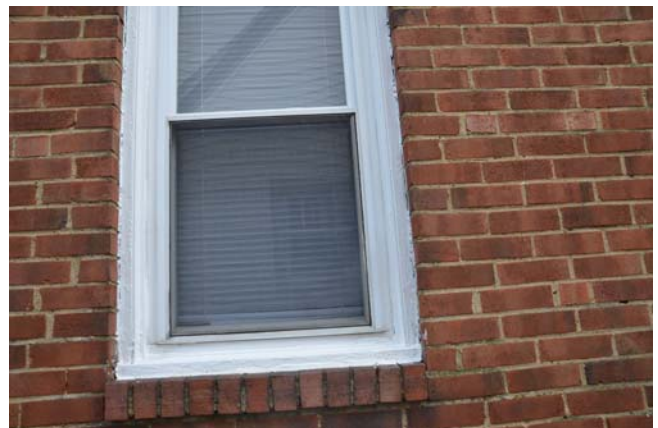
No peeling paint on exterior windows.