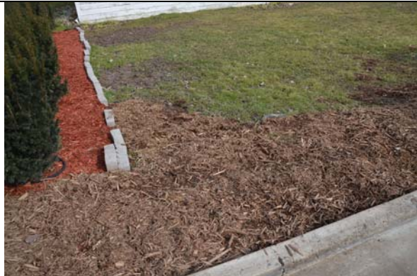
No exposed soil near removed garage. All areas are grass or mulch covered.