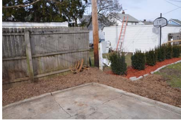
No exposed soil near garage areas. All areas are grass or mulch covered.